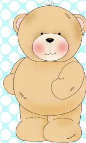
A gummy bear.